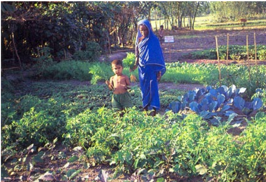
The old and the young nurture household garden plots.

Limited access to resources means that land-poor women are more likely to be under-employed. Household gardening offers women an important means of earning income without overtly challenging cultural and social restrictions on their activities. Since women are frequently the principal providers for family diets, enhancing their purchasing power and food production capacity has a direct impact on household nutrition and health.