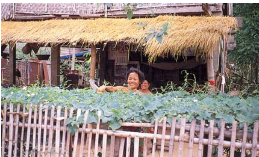
Ivy gourd adapts to household resources.

Promotion through motivation of new or improved household garden activities requires creative communication abilities. Increased and fostered awareness of household production as a means to alleviate economic and health problems can produce remarkable results (see next box). Media messages can simply stimulate interest in the processing of garden produce, especially where markets are far away, and economic returns from sales guarantee the sustainability of project results. Over-commercialization, however, may impair nutritional gains. Increased income may not be spent on rounding out the family diet. There may be disadvantageous nutritional “balances of trade” when highly nutritious household garden crops are exchanged for high priced but low nutrition foods.